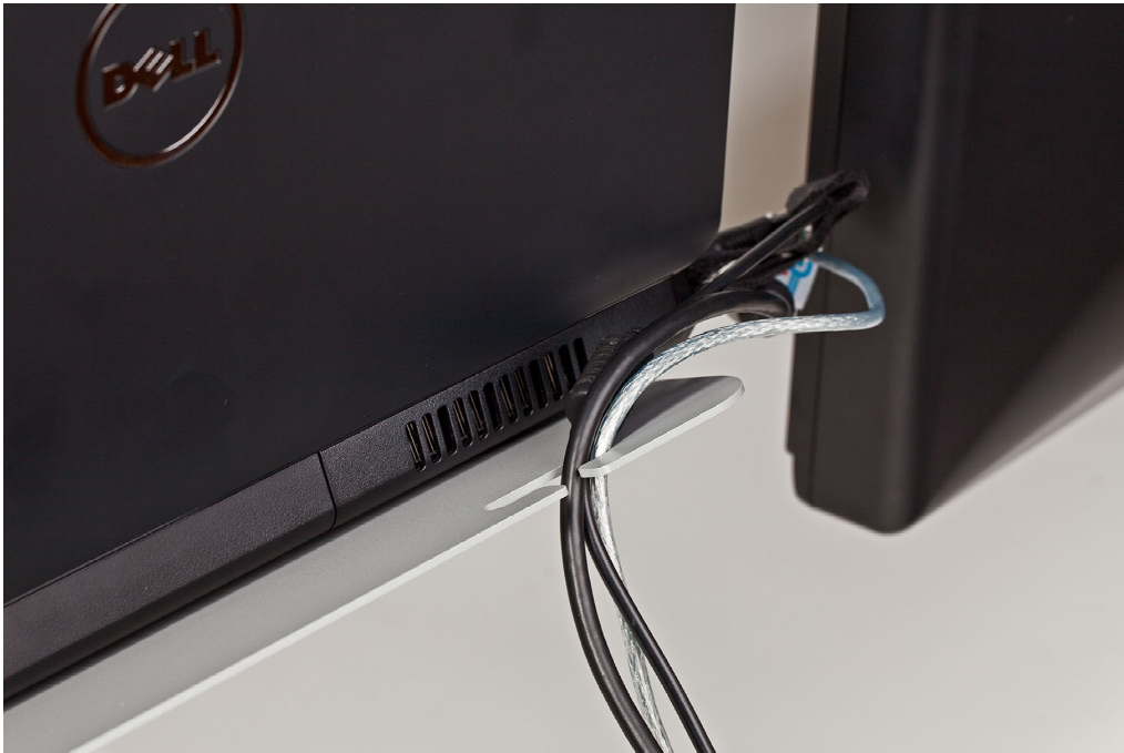
Cable catches ensure cables are out of the way but easy to find