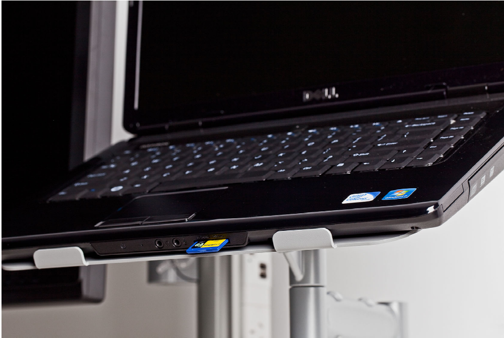
Integrated tabs securely hold the laptop in place